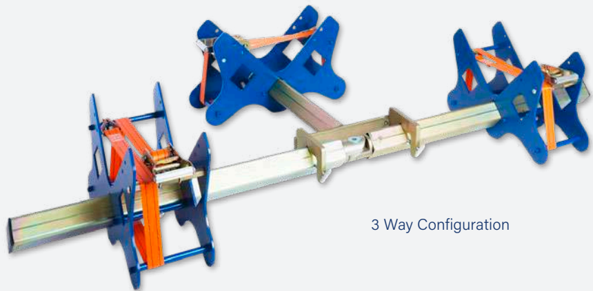
3 Way Configuration

Caldertech Europe Bretfield Court, Dewsbury, West Yorkshire WF12 9BG, UK T: +44 (0)1924 469571 E: info@caldertech.com